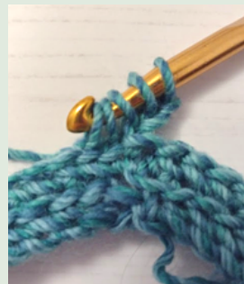
Start of Round 3