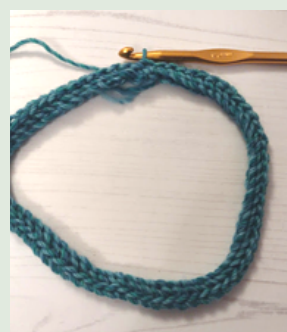
End of Round 1