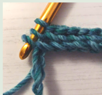
Round 1: Herringbone sc

Round 9 (RS): Work herringbone sc as Round 2, in the blo of Round 8. Join round with a slst. (You can repeat round 9 once more if you would prefer a deeper cowl.)