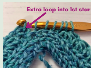
End of Round 3

Note: If you feel the cowl will not be deep enough for your preference, you can add more repeats of Rounds 3&4 to continue the star stitch pattern